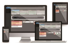
The iAM Command & Control Interface

Wohler Technologies has been in business for over 30 years. We invented in-rack monitoring and we are now RE-INVENTING this broadcast technology for the modern media enterprise to handle IP MONITORING.