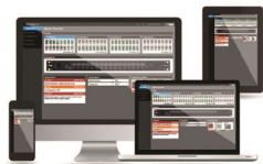
The iAM Command & Control Interface

Wohler Technologies has been in business for over 30 years. We invented in-rack monitoring and we are now RE-INVENTING this broadcast technology for the modern media enterprise to handle IP MONITORING.